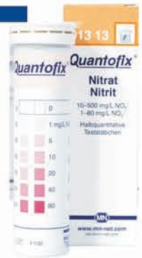
TLC Plates & Rapid Tests