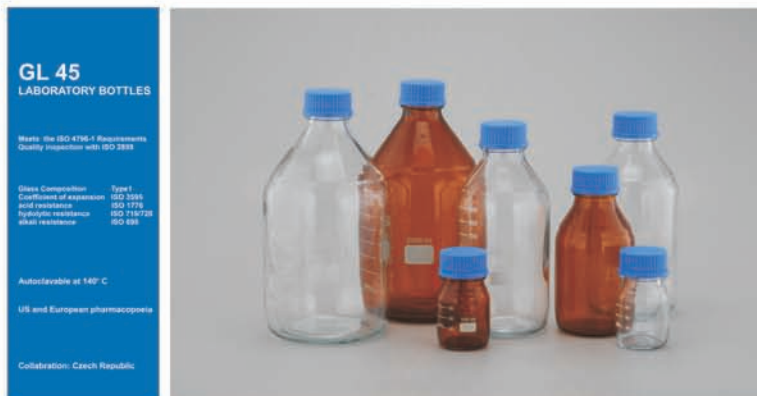
Meets ISO4796-1 Requirements. US & European pharmacopoeia