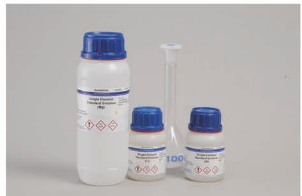
Traceability to primary certified reference materials (NIST).